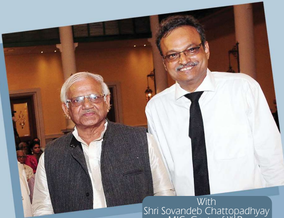
With Shri Sovandeb Chattopadhyay MIC, Govt. of W.B.