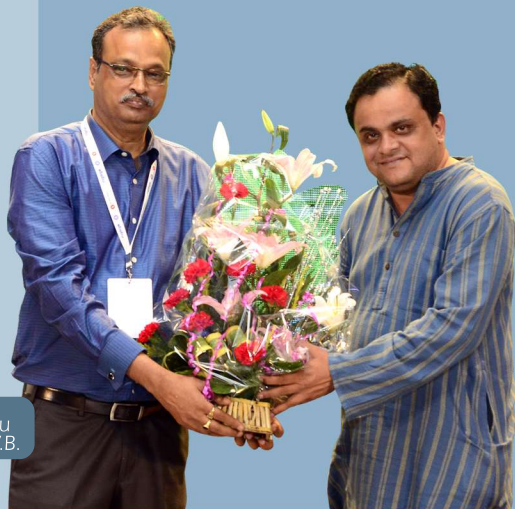
With Shri Bratya Basu MIC, Govt. of W.B.