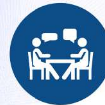
One to One Consultation (For Advanced Certification course)