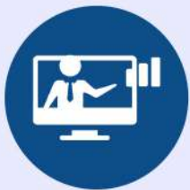
Online & Hybrid Classes