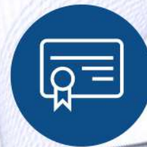
Joint Certification from BCC&I & Seven Boats Academy